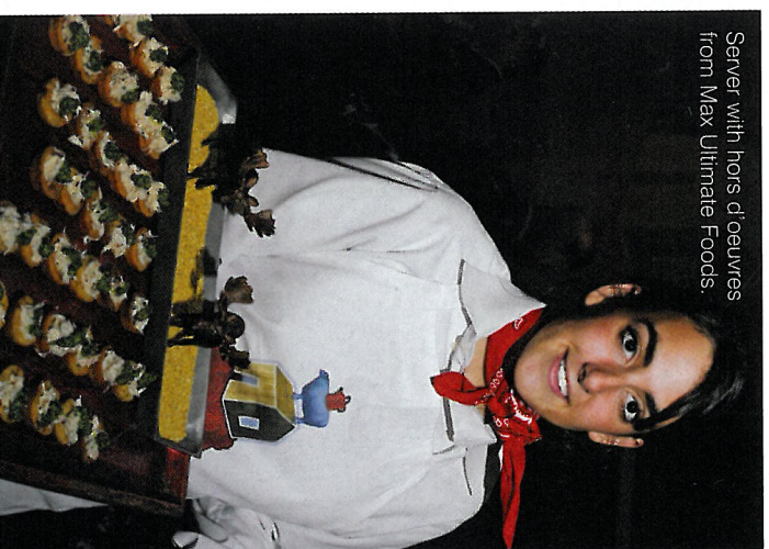
Server with hors d'oeuvres from Max Ultimate Foods.