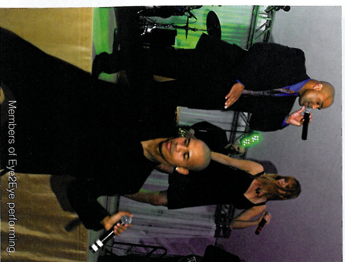
Members of Eye2Eye performing.