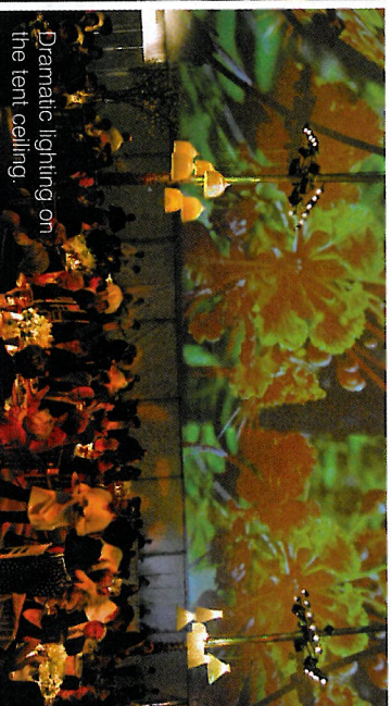
Dramatic lighting on the tent ceiling.