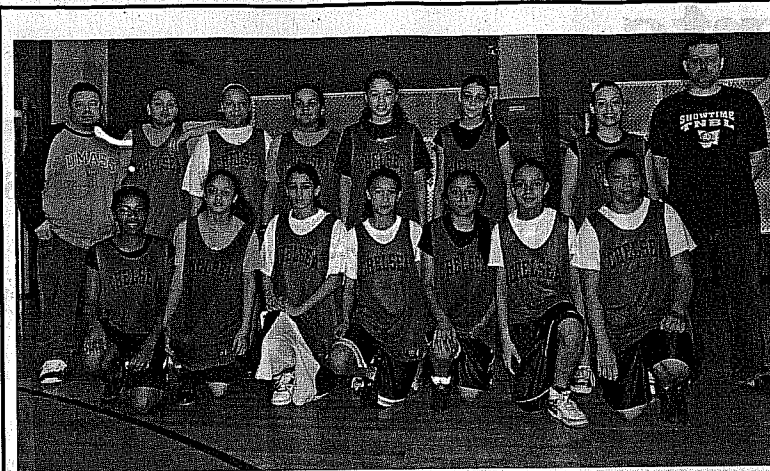
The Chelsea Boys and Girls Club 13-and-under girls team

The Chelsea Record • Thursday, April 10, 2008